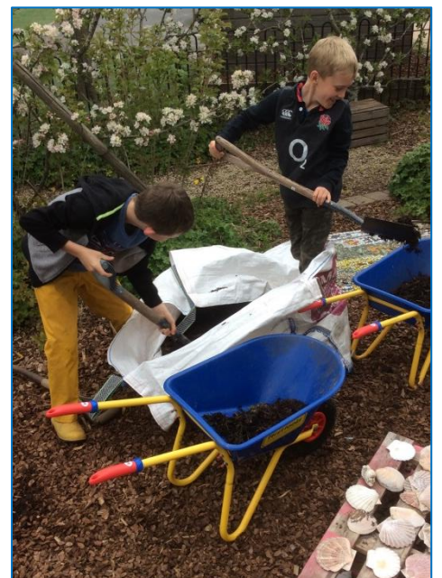
The children were busy at Gardening Club this Monday, planting seeds and doing a great job of tidying the garden ready for the summer term.